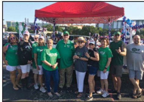
AHS Alumni took time out before the July 4 parade began to show their school spirit.