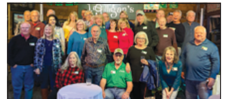
AHS Class of '68 got together recently to reconnect and celebrate #55.

Don't miss out on the opportunity to connect with your classmates and stay up to date! Get upcoming reunion contact information listed below the calendar to the left, or at https://www.ahscolts-alumni.org/ .